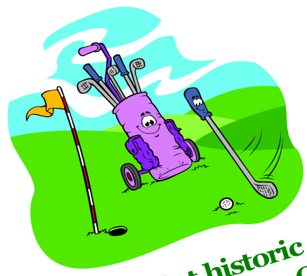
Golf at historic Virginia Country Club